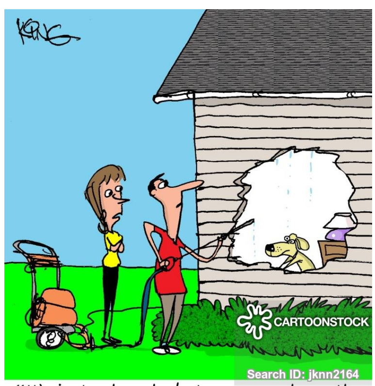
"It's just a hunch, but you may have the power set too high on your pressure washer."

07 871 7711 work 07 871 8707 after hours