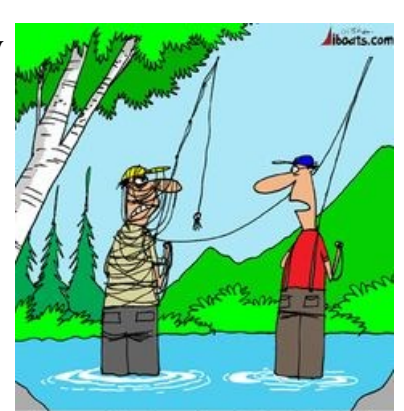
"Sorry. Casting when it's windy isn't one of my strong points."