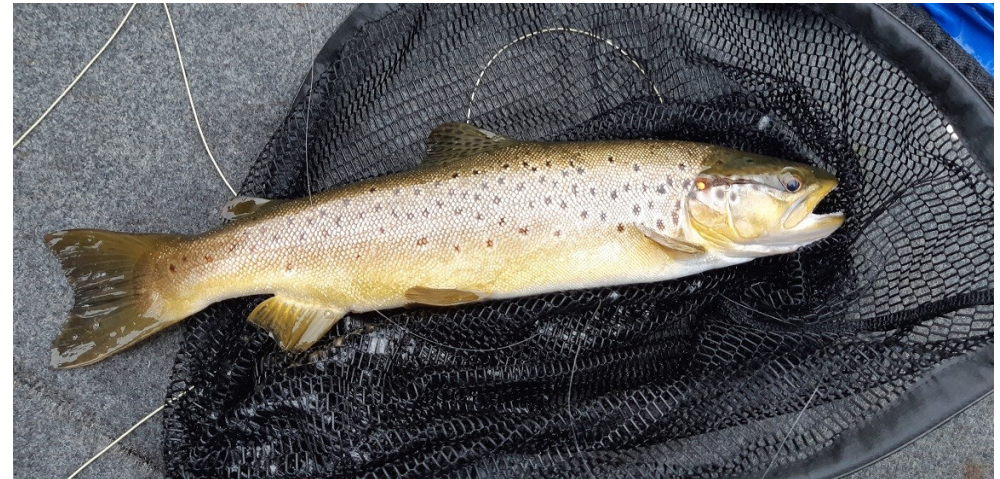
A nice brownie caught by Ray

Over the to days we landed 15 fish, but to be honest nothing over 3lbs really and a lot had 'shag marks' on them. Richard and Brian decided to stay and fish the lake again on Sunday morning with another 5 landed. Ray and I moved on to try out Rerewhakaaitu on the way home. We decided to fish the 12/14ft water just as the weed drops off to the deeper water – always the prime spot on this lake. We landed 3 and Ray 'lost' the best fish of the weekend – jumped a few times to check us out and then spat the hook!!