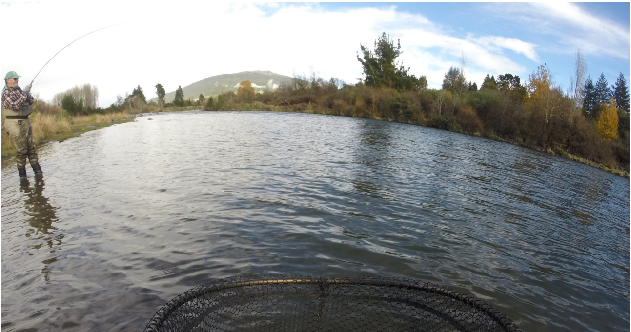
Fish on Judge's Pool