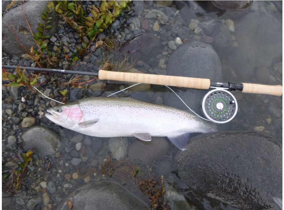
Tongariro jack on the Epic DH11 4#

So, after 5 years what have I learnt? Double handed rods may not be the most efficient way to catch trout. If I wanted to catch a lot of fish, I would probably use a Euro nymphing and/or indicator nymphing rig; neither of which appeal to me. However, I rarely have a blank day and when I do most other methods blank as well. I certainly catch enough fish to keep me happy. I tie small trout intruder flies and bead head woolly buggers but, to be honest, the humble woolly bugger is probably the only fly you need. I currently fish 2 rods, an Epic 11 foot 4 weight trout spey rod that I built from a kit which I have a 275g OPST Commando Skagit head and use 12 foot Commando 96g sink tips on and a Vision Onki 11 foot 6 weight switch rod that I use a 325g OPST Commando Skagit head and 132g 12foot sink tips. I use OPST laser running line on both rods. The 4 weight is my main rod and will handle just about any fish I will encounter, however when conditions get a bit gnarly, (wind, high flows), the 6 weight gives me a bit more control. If I could only have 1 or was a beginner I would probably go for the 6. I like the OPST system, they made the original short Skagit, trout spey lines; but Scientific Anglers, Rio and Airflo all make trout spey systems.